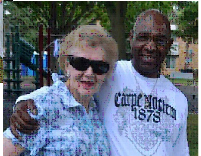
Neighbors & festival organizers