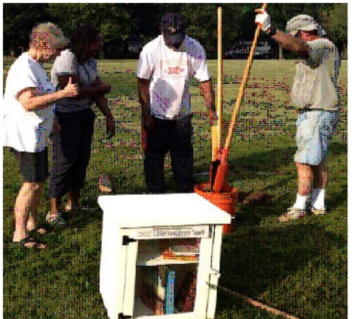
“Planting” the Little Free Library

The Meadowood Neighborhood Association Board of Directors meets at 7:00 pm the first Wednesday of every month (except July when there is no meeting) at the Meadowood Neighborhood Center. Meetings are open to the public. www.facebook.com/Meadowood.Neighborhood.Association