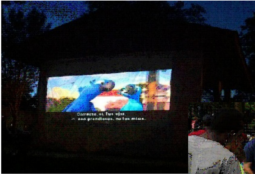
Movie Night: "Rio," in the park