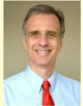
Dane County Executive Joe Parisi

Emergency Order #11 began December 16 and will be in effect for 28 days. The order mirrors much of Order #9 and allows indoor gatherings of up to 10 people, with physical distancing and face coverings, and allows outdoor gatherings of up to 25 people, with physical distancing. Click here to learn more.