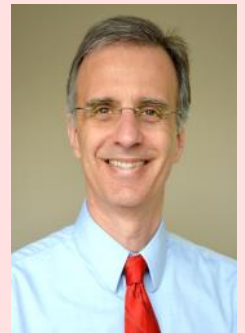
Dane County Executive Joe Parisi

Dane County's RNG facility and offload station are turning trash and cow manure into renewable fuel, while preserving our local environment and natural resources. Our 100-vehicle RNG fleet is also saving taxpayer dollars and reducing carbon emissions during a time when gas and diesel prices have soared. By investing in clean fuel infrastructure, Dane County is leading the way on what is possible to help combat climate change and be part of the solution.